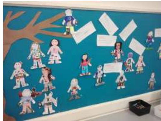
Our mini-me's getting to know each other in Room 6.

On our mini me's we used pictures that showed things about ourselves - like family, hobbies, favourite colour, sports, favourite subject.