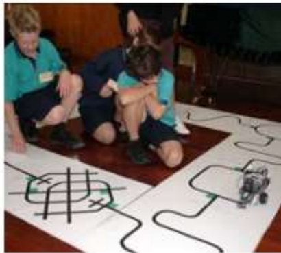
Children are welcome to attend the evening.